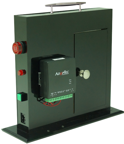
TimeTec Barrier BLE 2 Gate Control Relay Board