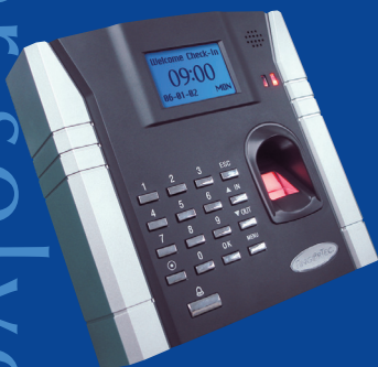
Model: AC801 / AC802 / AC803 / AC801 WG