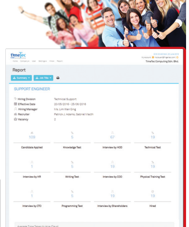
Summarises the number of applicants applied for the job post, the hiring stages with the applicant count for each stage, number of hired applicants and the average time taken for the company to hire applicants.

The report provides information of the source where applicants received news about the jobs. This allows the HR and person in charge to identify the most suitable channel for future job advertisement.