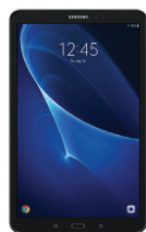
Samsung Galaxy Tab 10.1