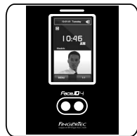
Face ID 4