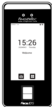
Face ID 5