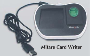
Mifare Card Writer