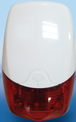
SIREN AND STROBE LIGHT (SS-911)