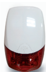
SIREN AND STROBE LIGHT (SS-911)