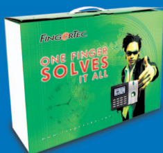
TA103-R Packaging Dimension (mm): 300(L) x 225(H) x 87(W) Weight: 1.5kg