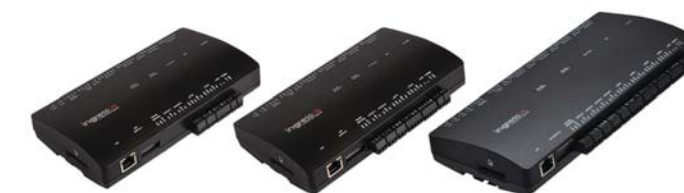
Ingressus I Ingressus II Ingressus IV