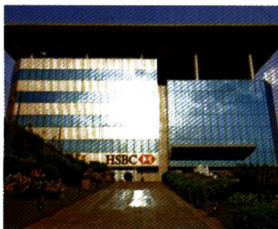
The HSBC Global Technology Centre at Kalyani Nagar develops software for the entire HSBC group